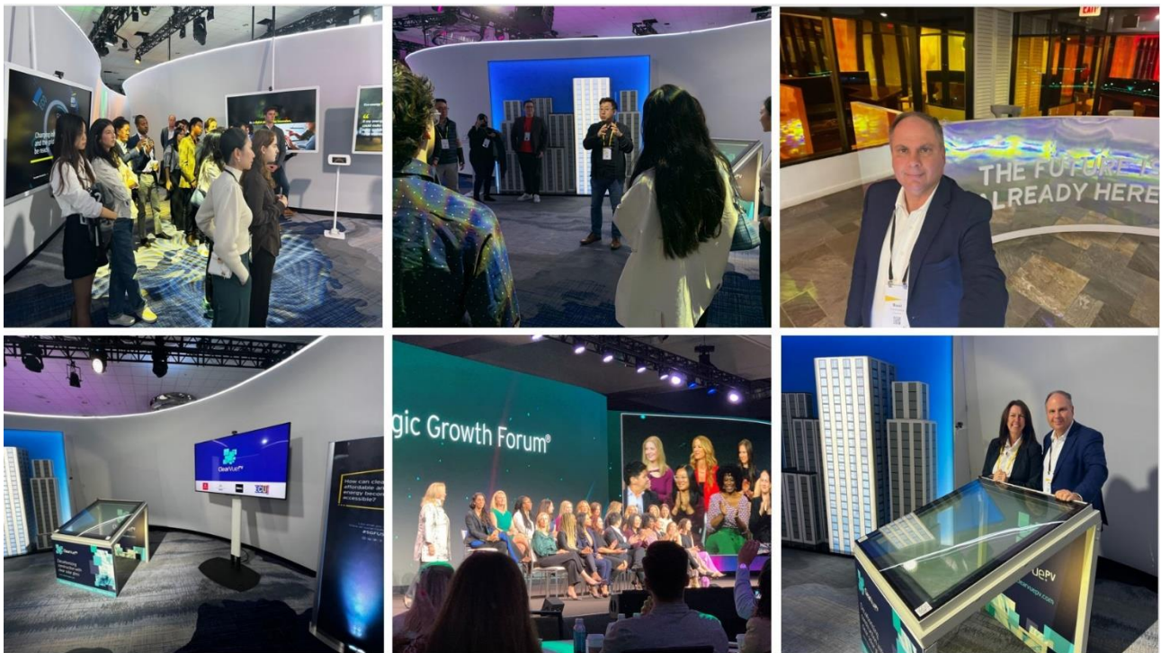
ClearVue’s PV IGU on display at the EY Strategic Growth Forum 2022 Illumination Experience display area.