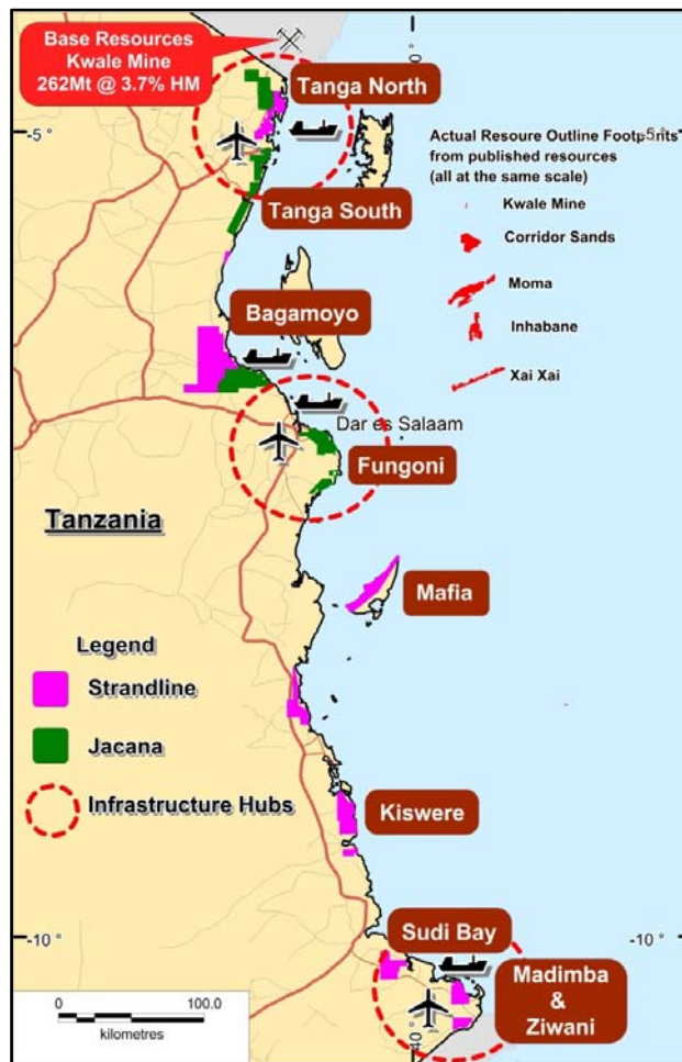
Figure 1. Dominant Mineral Sands Position in Tanzania

Jacana is selling JRT which controls Jacana's exploration assets, all of which are located in Tanzania (see Figure 1). These include high potential, underexplored, advanced exploration projects and an Indicated Resource, as well as large areas of well-located unexplored ground. In addition, JRT has strong graphite, nickel and coal prospects.