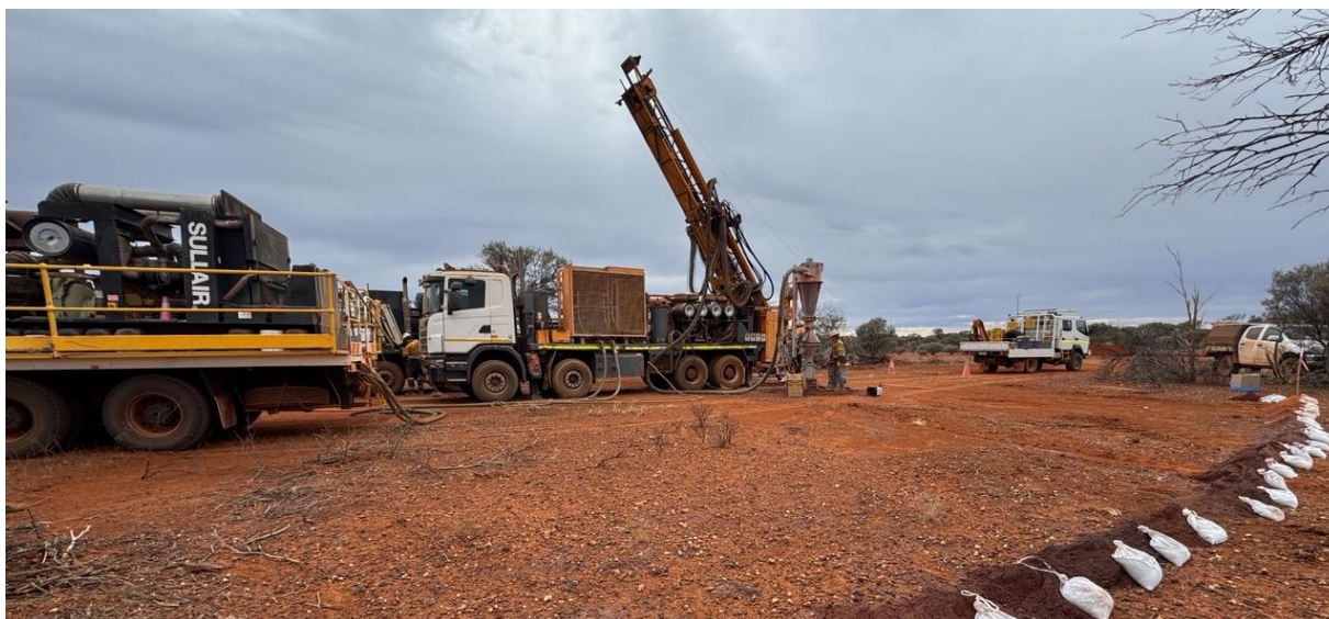
Figure 1. Weebo Project – RC drilling commenced