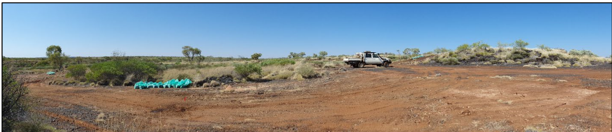
Figure 1. W2 Prospect, RC drill bags from WDRC031 in the foreground

"Over the next drill programs, we hope to continue our exploration success and understand the grade potential and delineate the mineralisation footprint along and across the 3km of mapped strike 2&3 ."