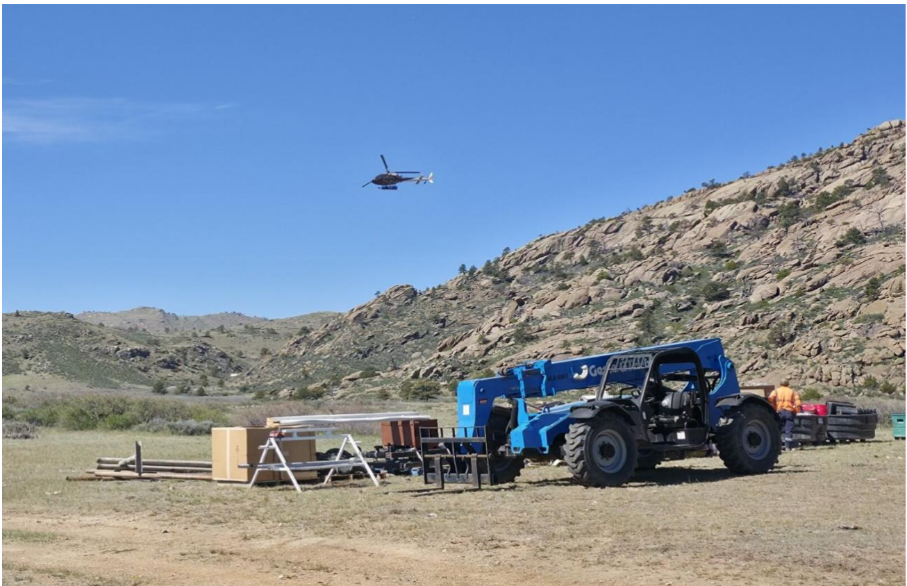
Figure 1- Exploration Staging Area

On site, core will be photographed, logged and split by field geologists before being dispatched to ALS Global for assay, Figure 3. Residual core will be stored for future confirmatory or specialized testing as required during the DFS.