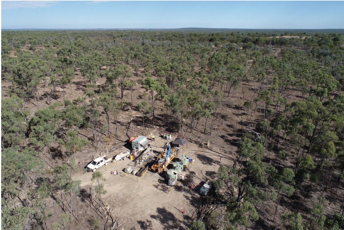
Figure 1: Aerial view of drill rig in place on first diamond drill hole at Glen Eva Project.