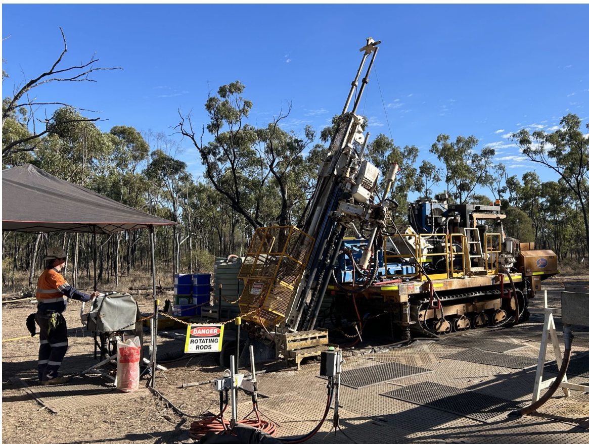
Figure 2: View of drill rig in place on first diamond drill hole at Glen Eva Project (drilling commenced on 19 May 2024).