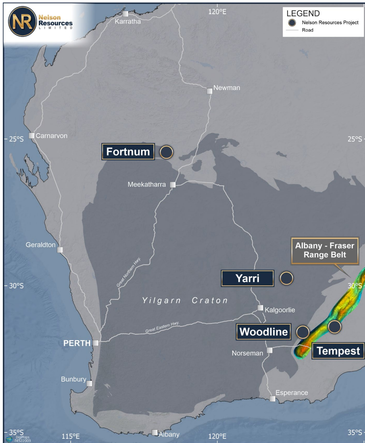
Figure 1 – Nelson Resources Project Locations