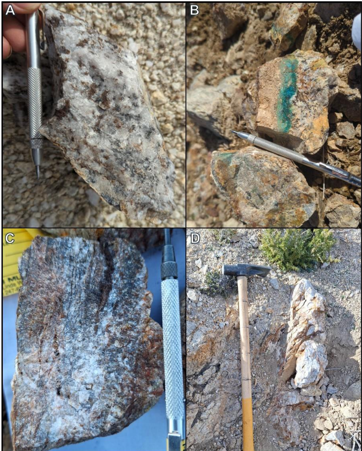
Figure 2: Significant mineralised samples from the recent mapping campaign.

A. Sample C239929 ( 12.3g/t Au and 296g/t Ag ). Quartz vein with bismuth telluride; B. Sample C239914 ( 15.15g/t Au and 0.27% Cu ). Silicified skarn material with malachite and oxidized sulphide. Euhedral garnets with vuggy and crypto crystalline quartz. C. Sample C239352 ( 4.6g/t Au and 440ppm W ). Laminated quartz vein with seams of hematite. D. Sample C239930 ( 2.78g/t Au and 162g/t Ag ). Laminated and brecciated milky white quartz vein with orange to dark brown limonite fracture coatings.