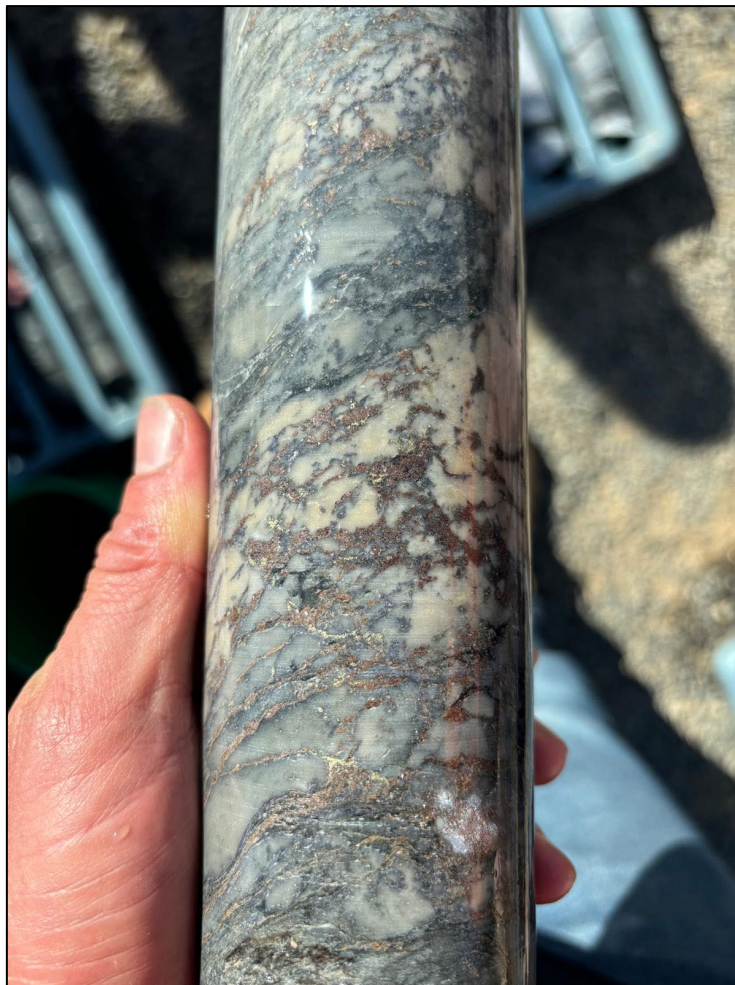
Figure 5: A3DD013 at 440m stringer sulfide veins of sphalerite (brown) chalcopyrite (yellow) from mineralised zone grading 2m at 2.7% Zn+Pb, 0.1% Cu from 439m

At June, AGC has commenced field activities while historical database integration continues. Drill targeting is being advanced across several priority prospects.