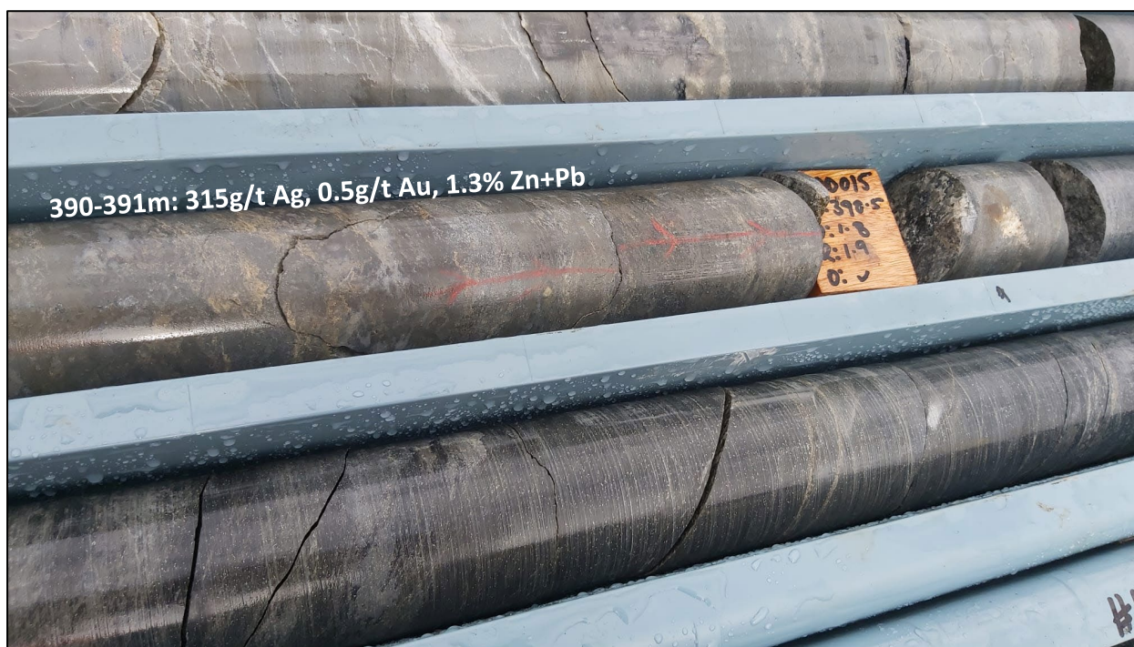
Figure 4: Core photograph from A3DD015, which returned 1.0m at 400g/t AgEq (315g/t Ag, 0.5g/t Au, 1.3% Zn+Pb) from 390m.