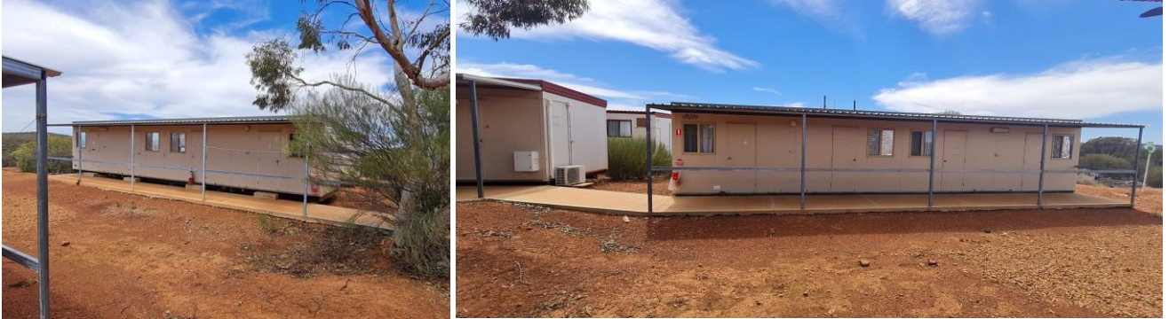
Figure 1 - Camp Infrastructure