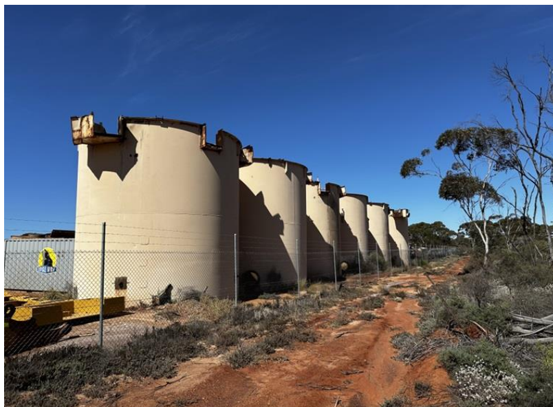
Figure 2 - CIL Tanks

The CIL tanks, which can supplement the existing infrastructure, can also be used to potentially expand the throughput of the processing facility above the 0.5Mtpa assessed in the Scoping Study. Additional details of the Camp Acquisition are set out in Annexure A.