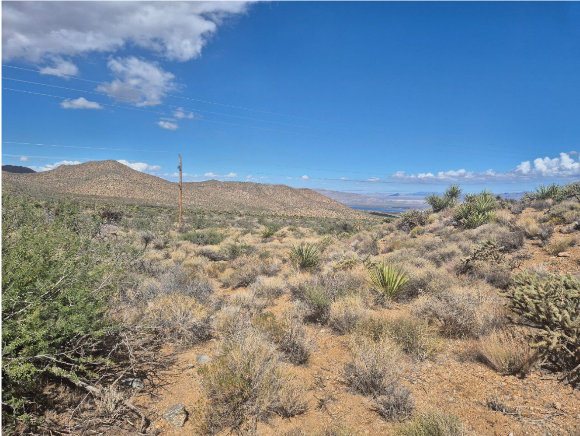
Figure 2: Looking east from target area three with the Solar PV farm in the distance.