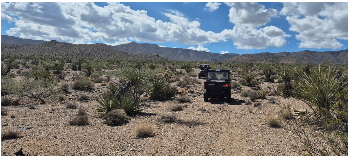
Figure 1: GNM field team on site during field work program.