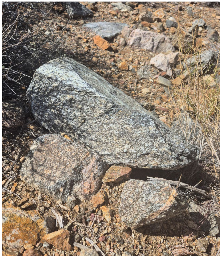
Figure 3: GNM team collecting rock chip samples.