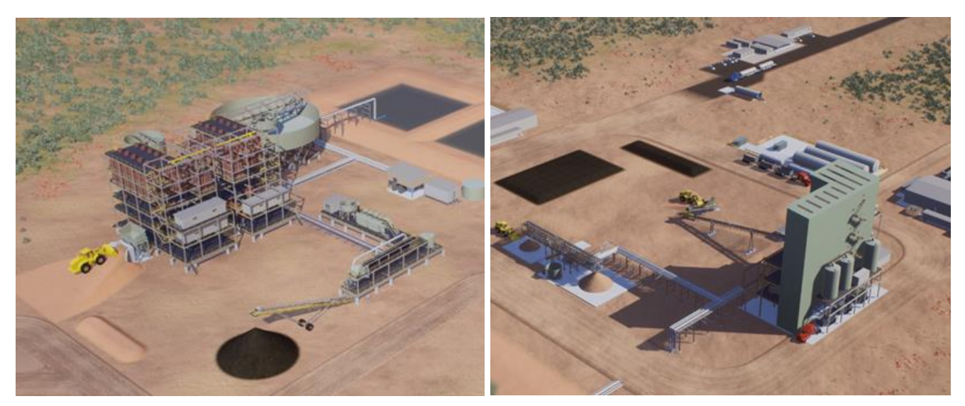
Figure 1 Coburn Preliminary 3-D Engineering Model of Wet Concentration Plant (WCP) and Mineral Separation Plan (MSP) Infrastructure

For more information on the Coburn Mineral Sand Project and the DFS, refer to the ASX Announcement dated 16 April 2019 for details of the material assumptions underpinning the production target and financial results. The Company confirms that all the material assumptions continue to apply and have not materially changed.