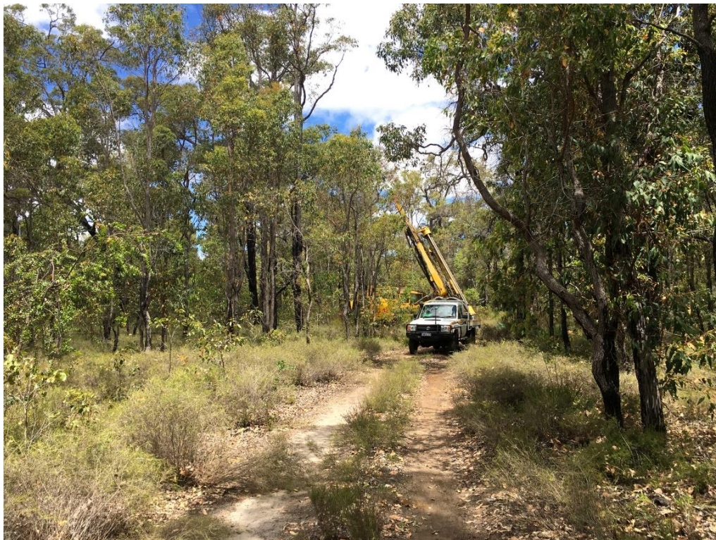
Figure 3: RC drilling underway on an existing track at the East Kirup Lithium Prospect

The exploration at E70/4763 is ongoing. A mapping and sampling program will commence next week at the Thomas A Prospect, which is an area of arsenic anomalism, which is a proxy for lithium in the Greenbushes region and is where historically pegmatites and surface kaolinite have been mapped.