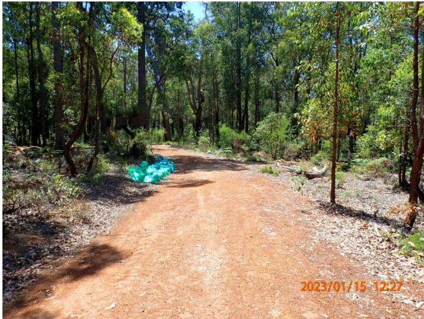
Figure 4: A rehabilitated RC drill pad at the East Kirup Lithium Prospect

“We are delighted with the RC drilling progress and results so far. The work has been carefully planned and conducted in accordance with an approved Conservation Management Plan (CMP). We look forward to the results of the diamond drilling program that is underway.”