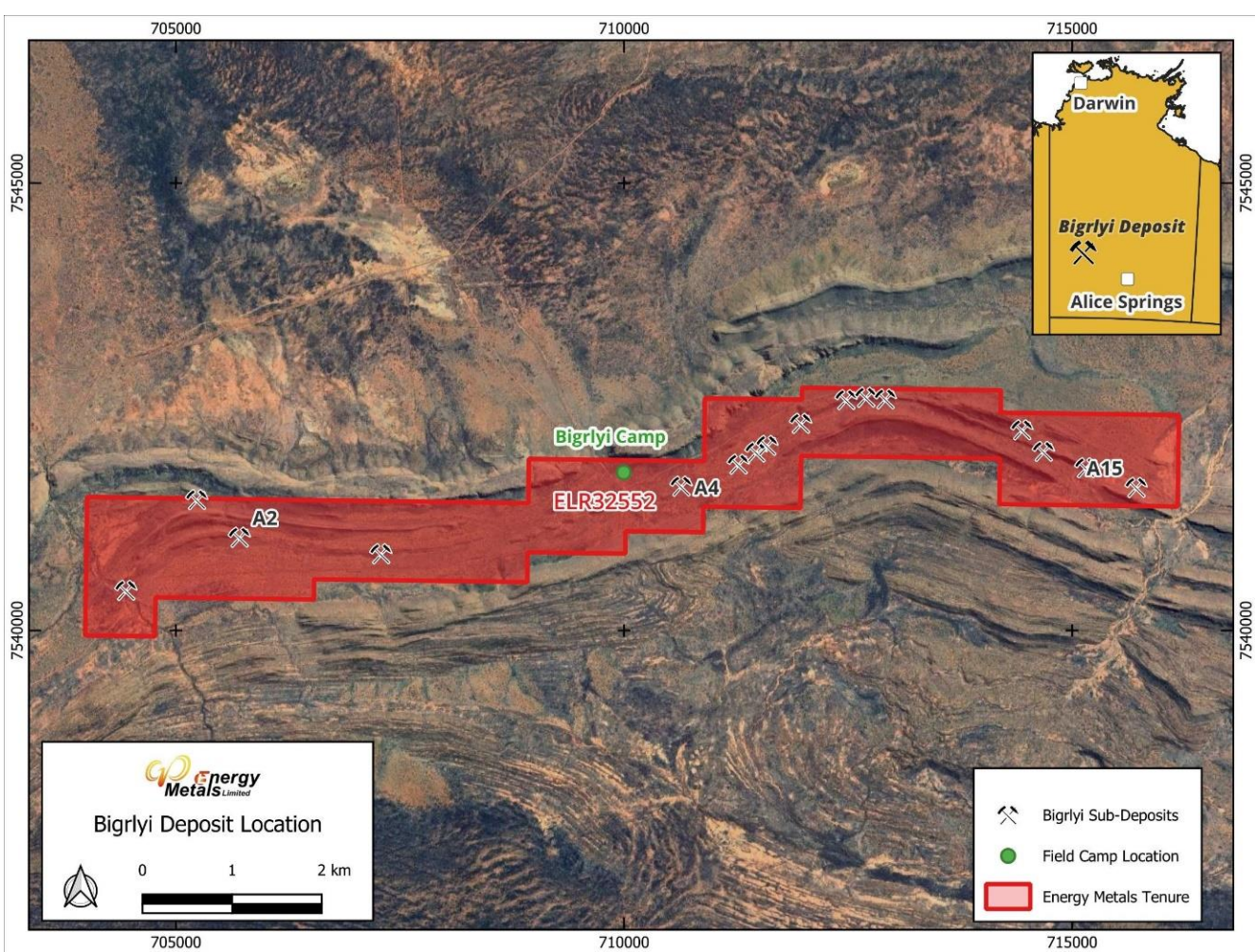
Figure 1: Deposit Location Map showing sub-deposits A2, A4, and A15.

Drilling commenced on site in July<sup>1</sup> with the aim of growing the uranium resource at Bigrlyi, which currently sits at 6.32Mt at an average grade of 1530ppm for 9.66Kt (21.3 Mlbs) contained U_3O_8 using a 500ppm cut-off<sup>2</sup>.