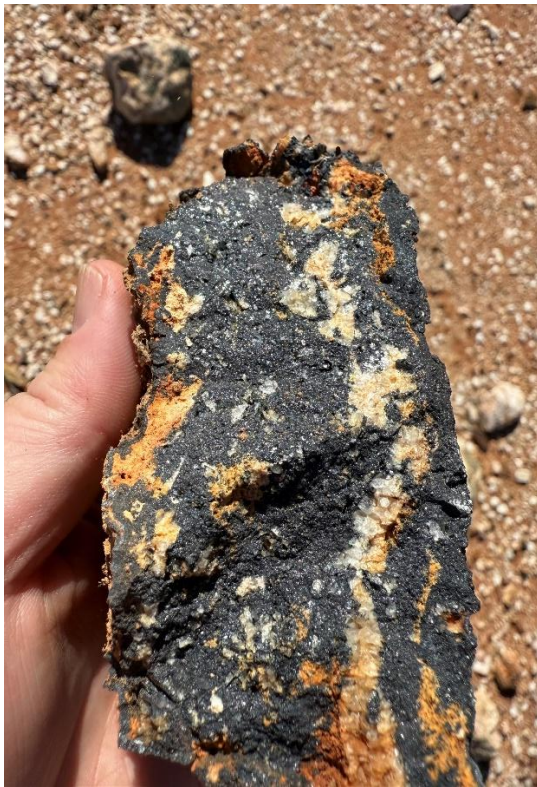
Figure 2 – Gallium mineralisation within hard pisolitic agglomerate yielding 1.68% Co from sample 30017