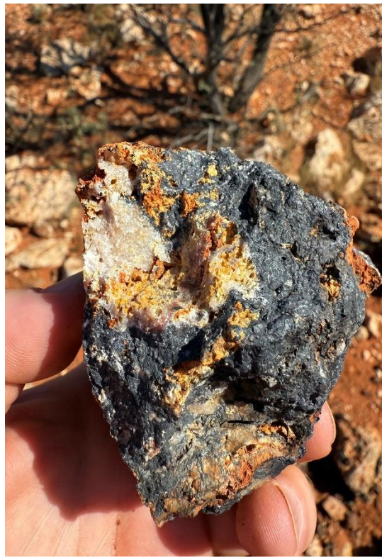
Figure 3 – Gallium mineralisation within hard pisolitic agglomerate yielding 1.12% Co from sample 30022