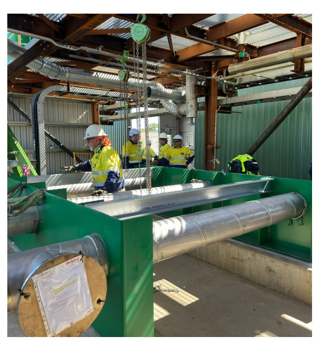
Heat exchanger equipment successfully installed

The reactor furnace has completed pre-commissioning checks and has been successfully energised to over 300 degrees Celsius in line with the initial testing procedures. Vendor confirmation was completed to further verify all systems are operating correctly, enabling a portion of the commissioning to be completed ahead of schedule. The remaining hot piping fabrication being carried out by Callidus is also near completion and will be transported to the CDP for installation shortly.