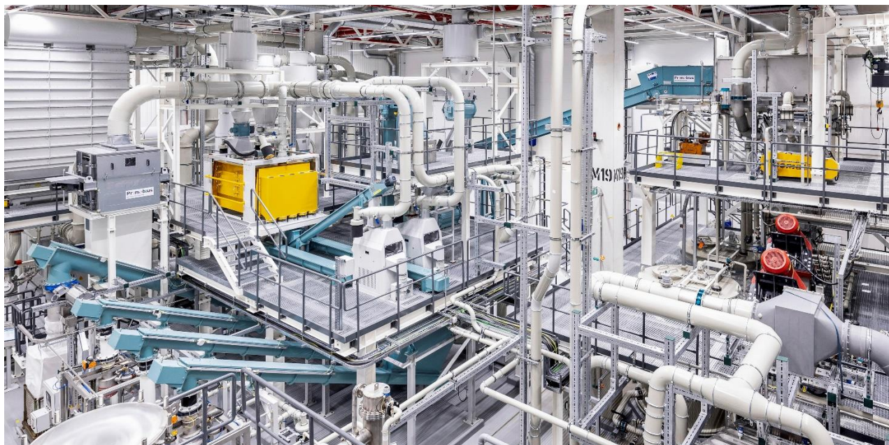
Figure 1 – Part of the Integrated LiB Plant installed by Primobius at Kuppenheim

In May 2022, Neometals announced that Primobius and Mercedes-Benz (" Mercedes ") had entered into a 5-year research collaboration aimed at jointly developing tailored, industrial-scale LiB recycling solutions for Mercedes-Benz. The industrial validation of Primobius patented recycling technology at Kuppenheim plant will precede the global offering of commercial scale ~20,000tpa integrated battery recycling plants.