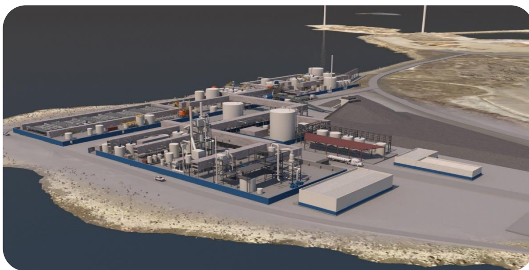
Figure 3 – Schematic View of the proposed VRP1 Plant at Tahkoluoto Port, Pori, Finland

During the period RISAB progressed a project financing process for equity and debt, with improved economics arising from an additional €15M conditional investment grant provided by the EU backed Finnish State NextGeneration fund and potential new 20% investment tax credit from the Finnish State.