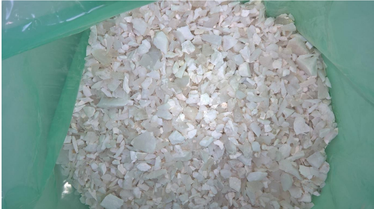
Figure 2: Preliminary products from previous testing work by Jericho Resources Pty Ltd contracted by Rum Jungle Resources Limited in 2016, 99.984% SiO 2

ASX Announcement | ASX: A8G | 27 May 2024