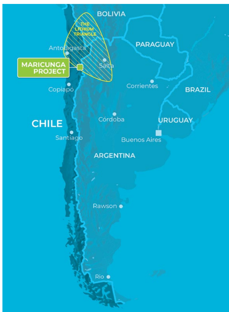
Figure 4: Location of LPI/MSB Maricunga Lithium Brine Project – Chile

LPI's ESG strategy involves much more than just isolated actions on different areas (such as energy provision, etc.). Its main objective is to take adequate account of social license, that is, the perception by stakeholders that a business or industry is acting in a way that is fair, appropriate, and deserving of trust. In summary, the strategy needs to be consistent with the company business model to address properly and through an integral view, the different Environmental (climate change, water management, biodiversity conditions, etc.), Social (Community engagement and participation, labour practices, etc.) and Governance (business ethics, etc.) aspects.