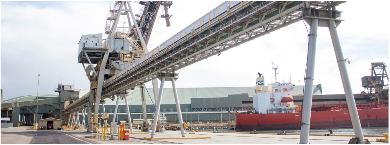
Figures 2 & 3 Images above of the Port of Geraldton