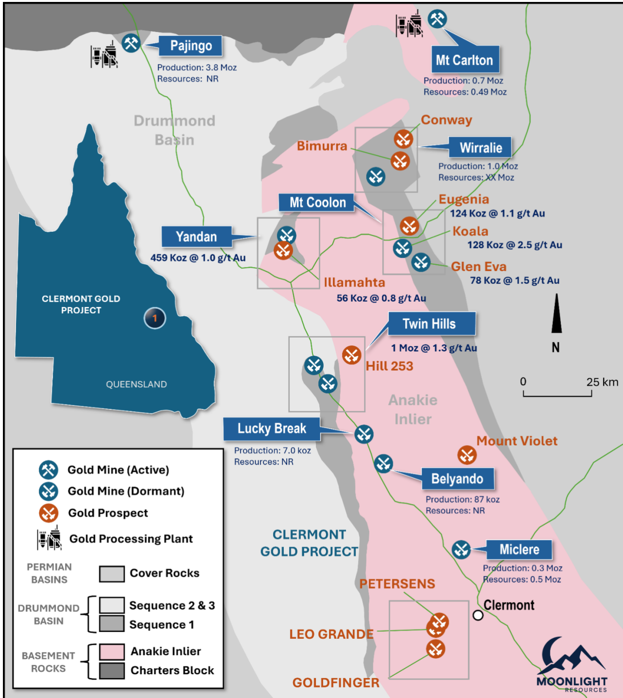
Figure 1 - Location and Regional Geology of the Clermont Project