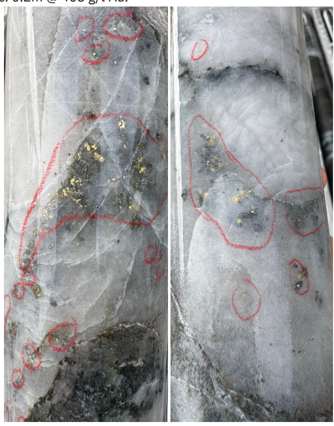
Abundant visible gold in hole OKDD25-044 at ~ 194m downhole.