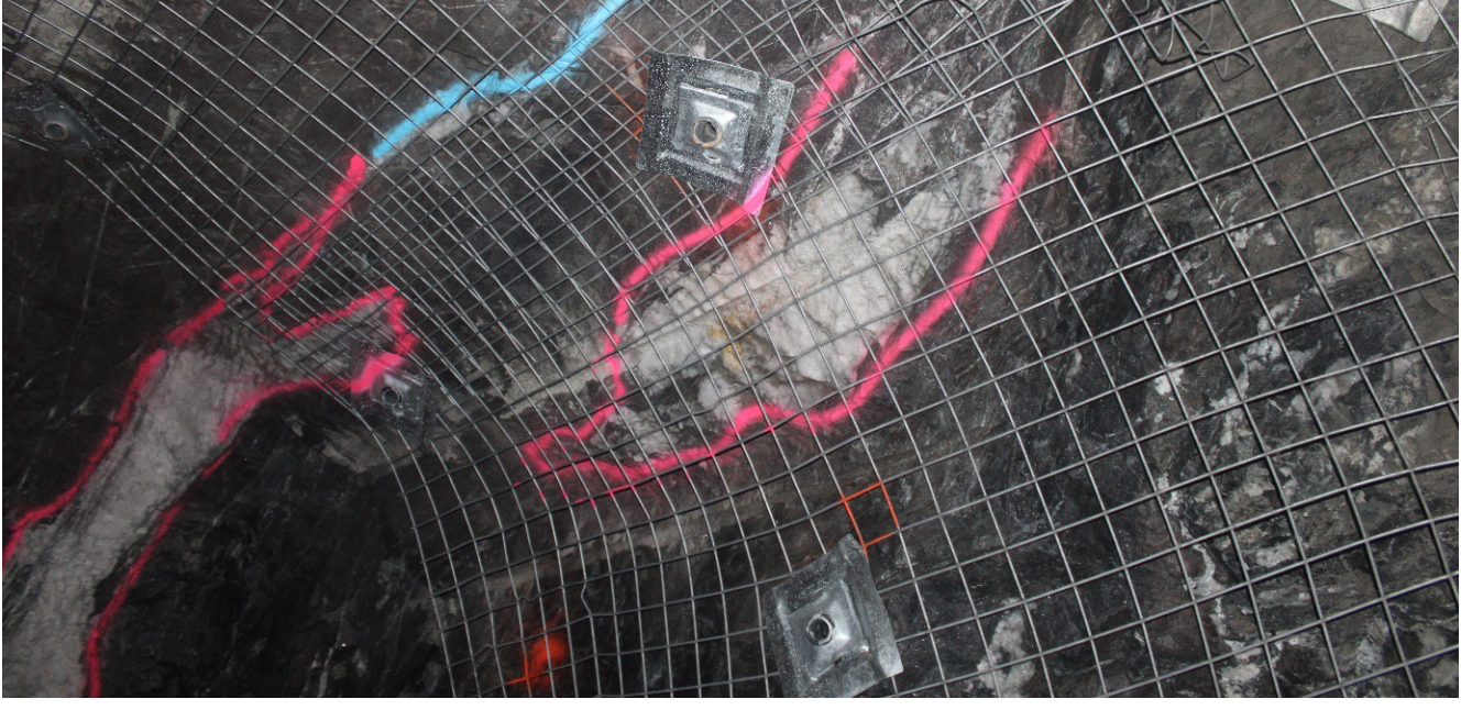
Visible gold in the lowest current development level on the O2 Lode.