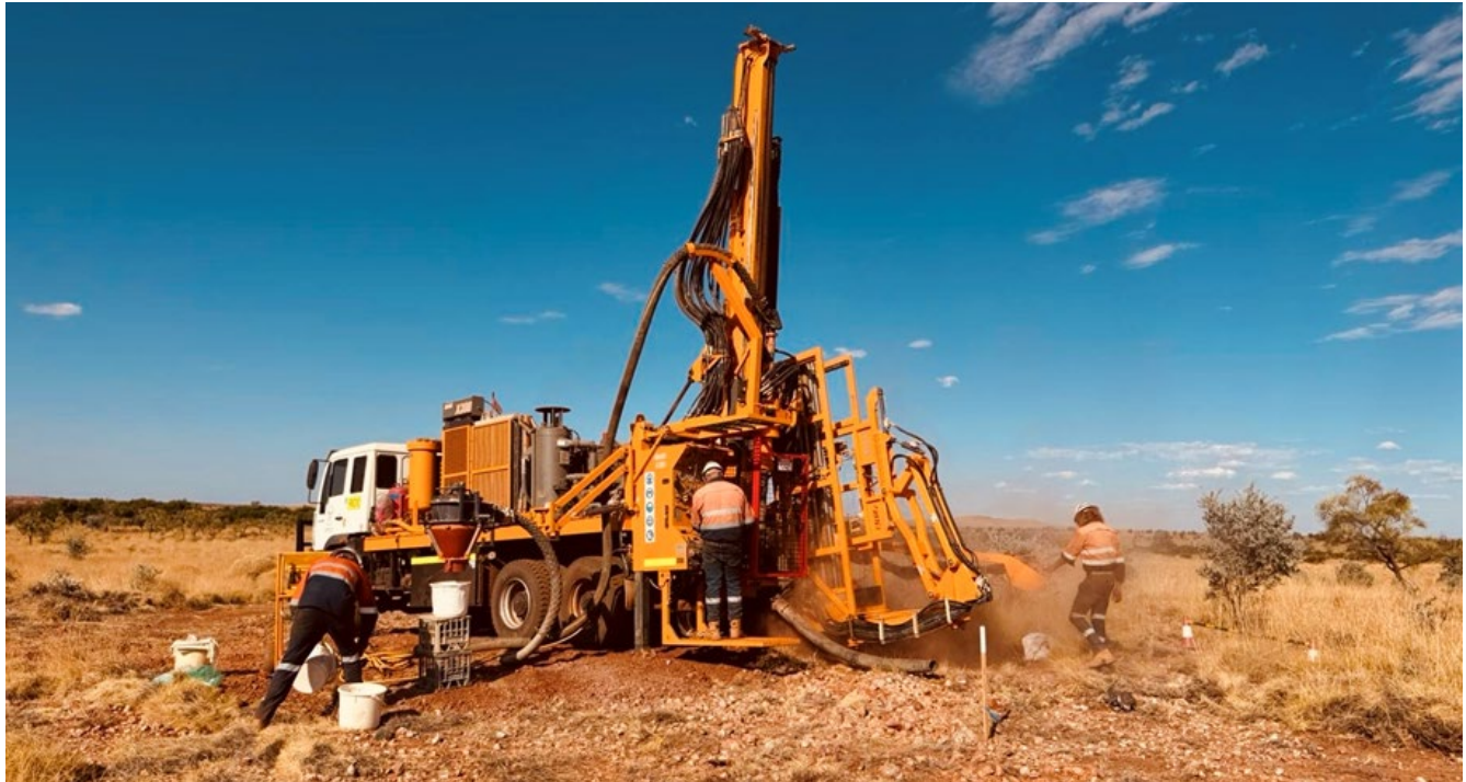
Figure 1 - Drill rig at the Sherman Prospect, Marble Bar Gold Project