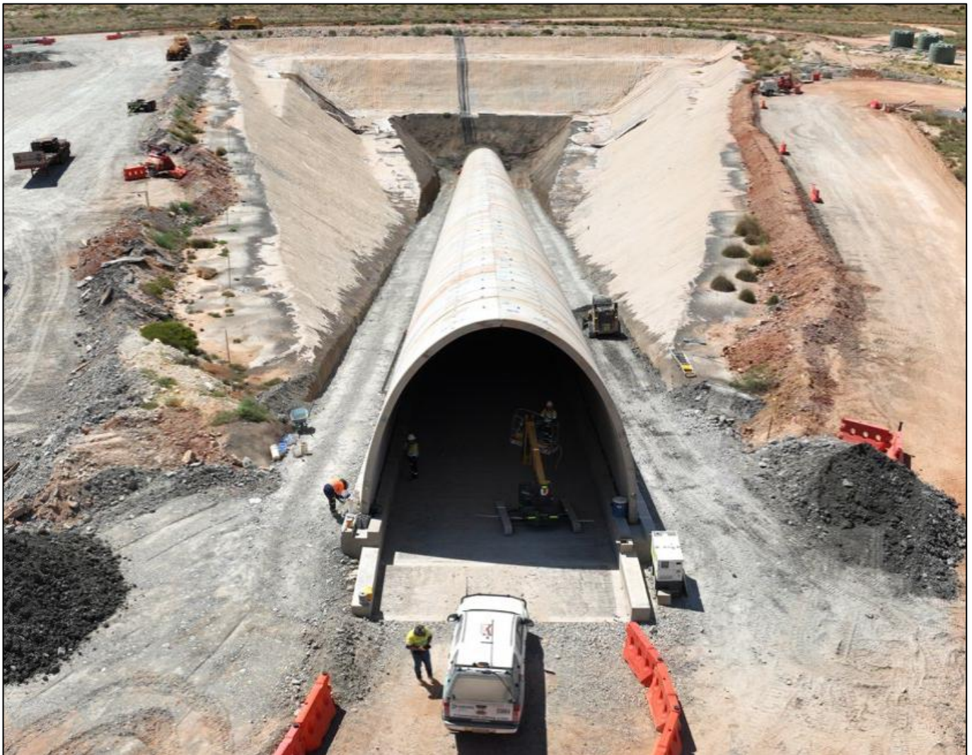
Figure 2: Completed instillation of precast floor footings and reinforced concrete at Havieron portal