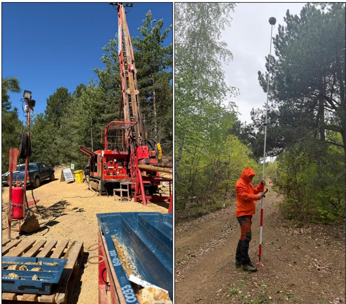
Figure 3: Maiden drillhole BAR033 at Barje and field survey