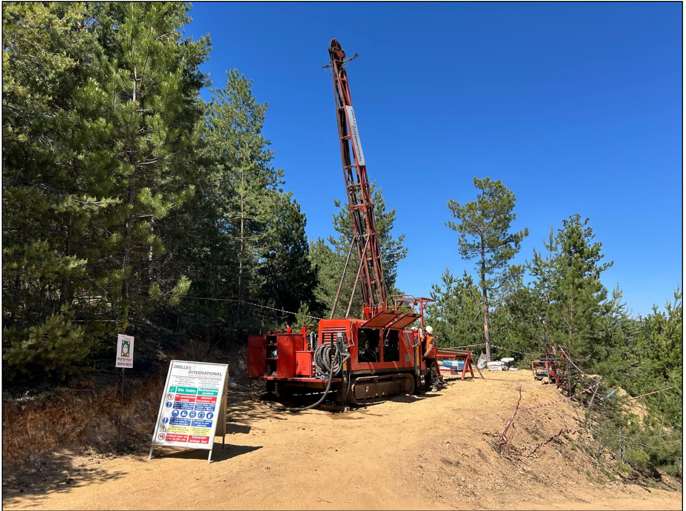
Figure 1: Maiden diamond drillhole of Minrex's 2026 infill campaign at Barje

Barje hosts a near-surface, high grade NI 43-101 Inferred mineral resource of 670Koz Au Eq @ 2.9g/t Au Eq (7.1 Mt at 2.5 g/t Au and 38 g/t Ag containing 570,000oz Au and 8.8Moz of Ag) 2 and is the focus of a fully funded drilling program of approximately 7,000m designed to: