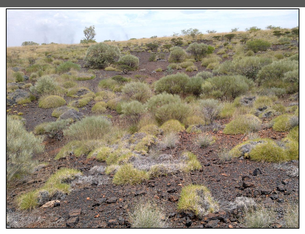
Figure 4. A gulley from the northern manganese corridor exposing widespread manganese outcrop (looking south east). Refer to Figure 1 for the location