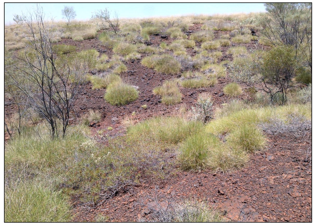
Figure 5. A gulley from the northern manganese corridor exposing widespread manganese outcrop (looking south west). Located north of sample WDRC036 – 42.3% Mn (pXRF). Refer to Figure 1 for the location