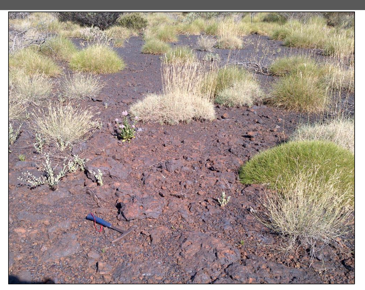
Figure 6. Outcrops associated with sample WDRC041 – 43.2% Mn (pXRF). Refer to Figure 1 for the location