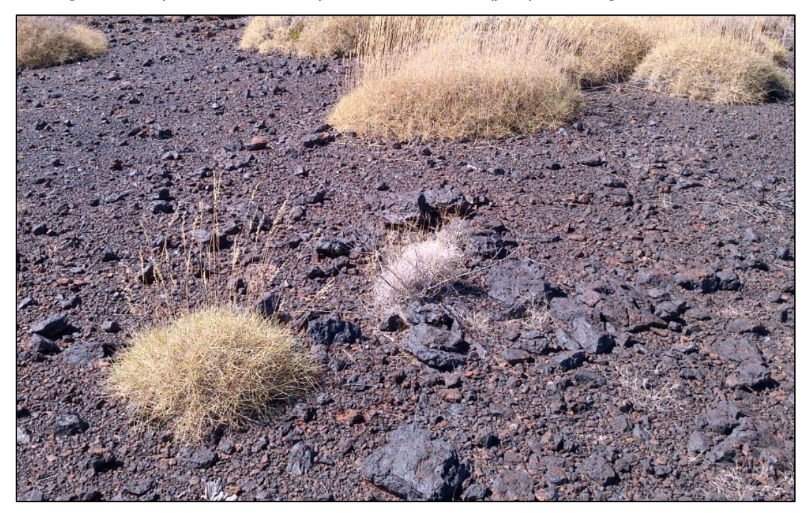
Figure 3. Outcrops associated with sample WDRC002 – 58% Mn<sup>1</sup>. Refer to Figure 1 for the location