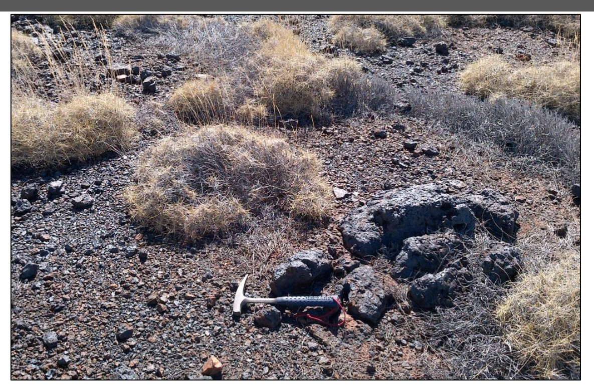
Figure 2. Outcrops associated with sample WDRC015 – 57.4% Mn (pXRF). Refer to Figure 1 for the location