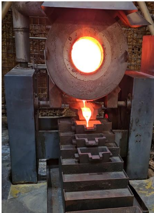
Figure 2 - BTR001 Gold Pour