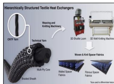
Fig. 3 Hierarchically structured textile heat exchangers — CNTF yarn to woven & knit spacer fabrics.

Pure is executing a downstream strategy anchored by a funded R&D collaboration with Rice University , focused on Carbon Nanotube Fibre thermal management technology for AI data centre infrastructure and defence applications.