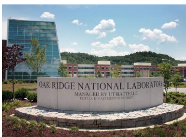
Fig. 2 US DoE Oak Ridge National Laboratory — HREE & Yttrium recovery programme.

The deposit has attracted a Strategic Partnership Projects Agreement with the US Department of Energy (DoE) Oak Ridge National Laboratory , targeting the recovery of Heavy Rare Earth Elements and Yttrium for United States critical materials supply chains.