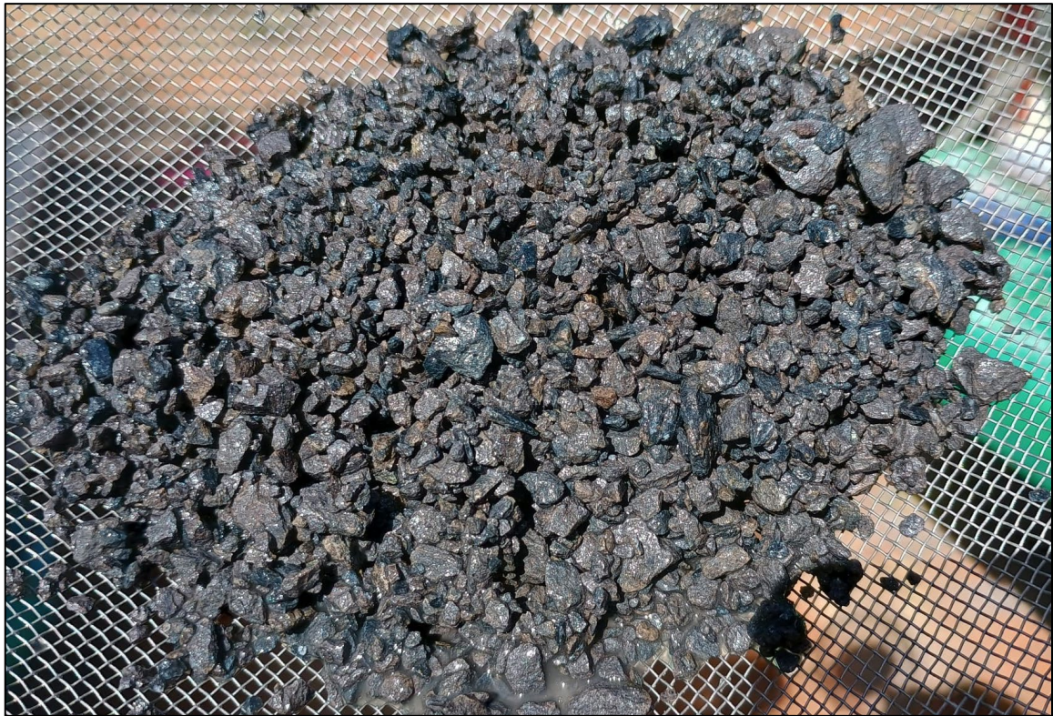
Figure 1: A3RC030 photo of massive sulphide from 115-116m, comprising the zinc mineral sphalerite (brown) and lead mineral galena (grey). This exceptionally high-grade interval yielded 13.8g/t gold, at least 3,000g/t silver, 11.4% lead and 27.4% zinc.