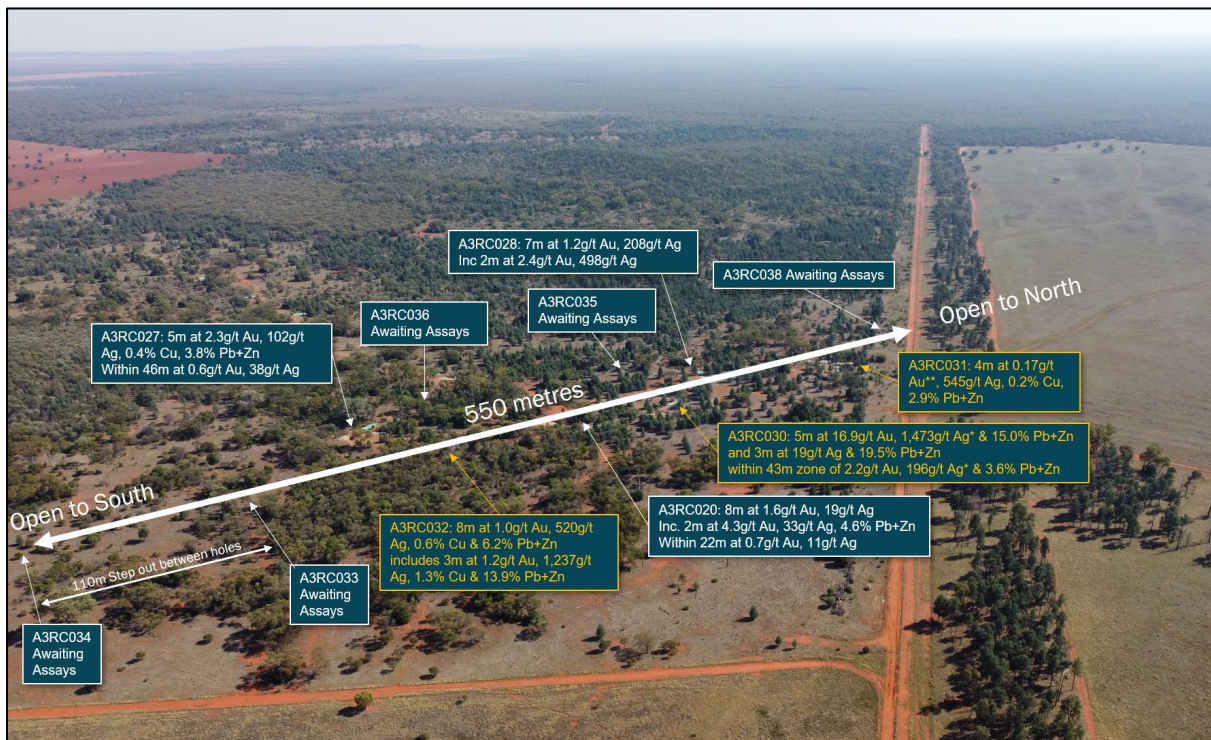
Figure 4: Annotated drone photo of Achilles looking northwest.