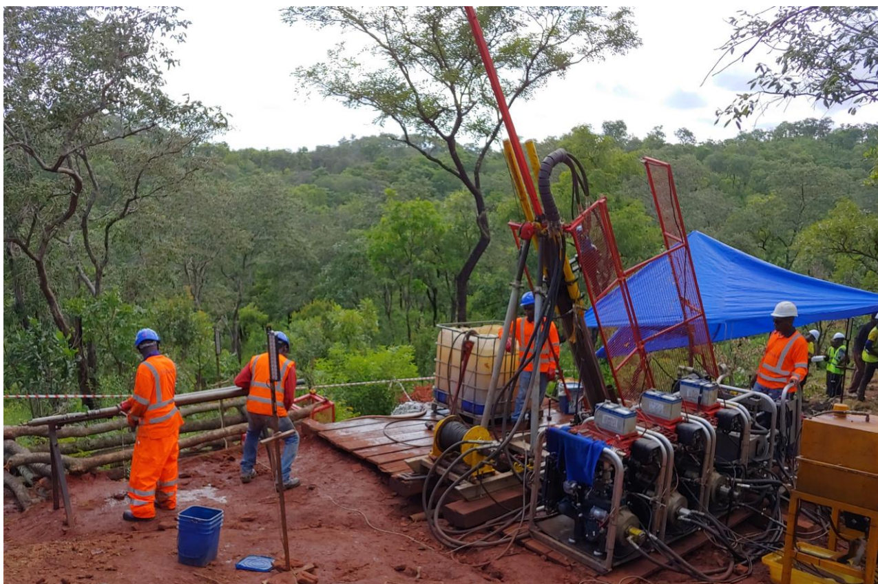
Photo 2. Diamond drilling to test the subsurface geology and geochemistry beneath a high-grade haematite outcrop at the Kowouleni target where a rock chip sample collected returned an assay in excess of 64% Fe.

Samples collected from the eleven drillholes have been dispatched to ALS Global for analysis. Upon receipt of the analytical results further follow up drilling will be developed based on the integration of all available information.