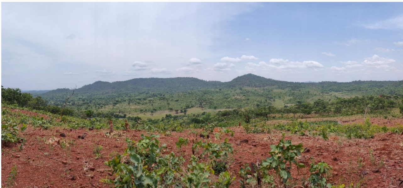
Photo 1. Dalabatini target taken from Diassa hill. Topographic relief highlights the 3,000m extent of the iron ridge.

The Dalabatini target consists of an identified prominent iron rich ridge that extends for 3,000m in a north-south direction and is approximately 500m wide ( Photo 1 ).