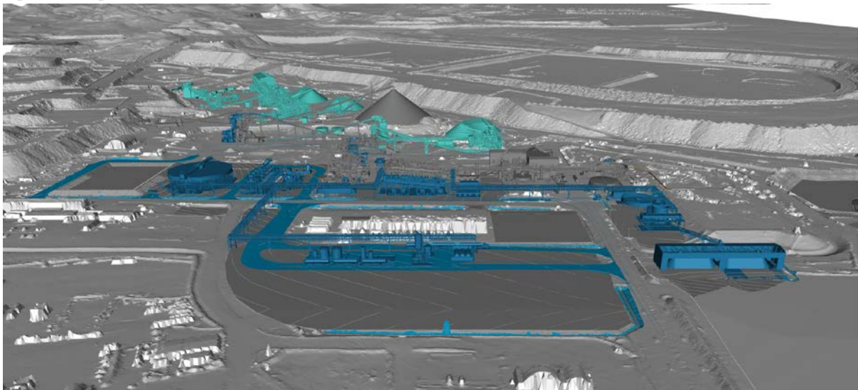
Figure 1 – Pilgan Plant schematic

Figure 1 schematic shows i) existing plant infrastructure in dark grey ii) P680 Project components in teal and iii) P1000 Project Expansion in dark blue.