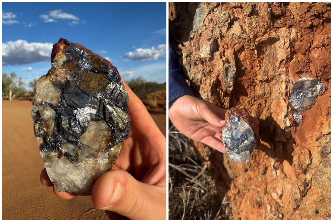
Figure 1: Galena (lead sulphide mineral) in quartz vein from Thowagee Mine workings – laboratory assay results expected within 4 to 6 weeks.