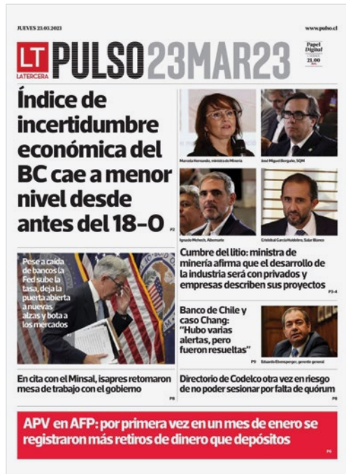
Figure 2: MSB is regarded as a core player in Chile's lithium sector, along with SQM and Albemarle. (Picture: After the session at the Senate with Mining Minister Hernando).