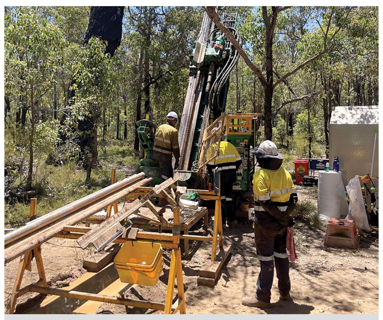
Figure 6: Diamond drilling in January-February 2023 at the East Kirup Lithium Prospect

Anomalies in the east and north showed that mineralisation was open to the east to the Thomas A prospect and further north. A sampling program commenced on the Thomas A area in February, in order to fully define the lithium anomalism. The assays of this partially completed program are pending.