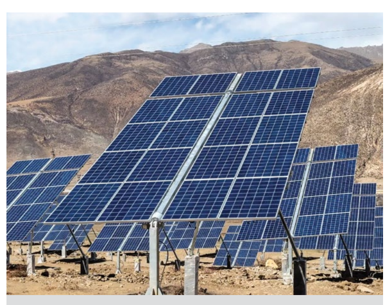
Figure 4: A solar generation project is being evaluated on indigenous community land to complement, and later replace, other energy supplies to the Maricunga project.

Ten holes for a total of 573 metres of RC drilling were completed along existing tracks. The majority of the RC holes were completed to 54m. Four holes, for a total of 360m metres of diamond core, were completed along existing tracks. Three holes were drilled to 100m, and one hole was drilled to 60m. All work was completed safely and in accordance with the strict environmental and dieback hygiene protocols as outlined in the Conservation Management Plan. All sites were rehabilitated on completion of drilling, but the holes remain accessible for further surveying or re-entry as required, pending thin section petrography and RC assay results.