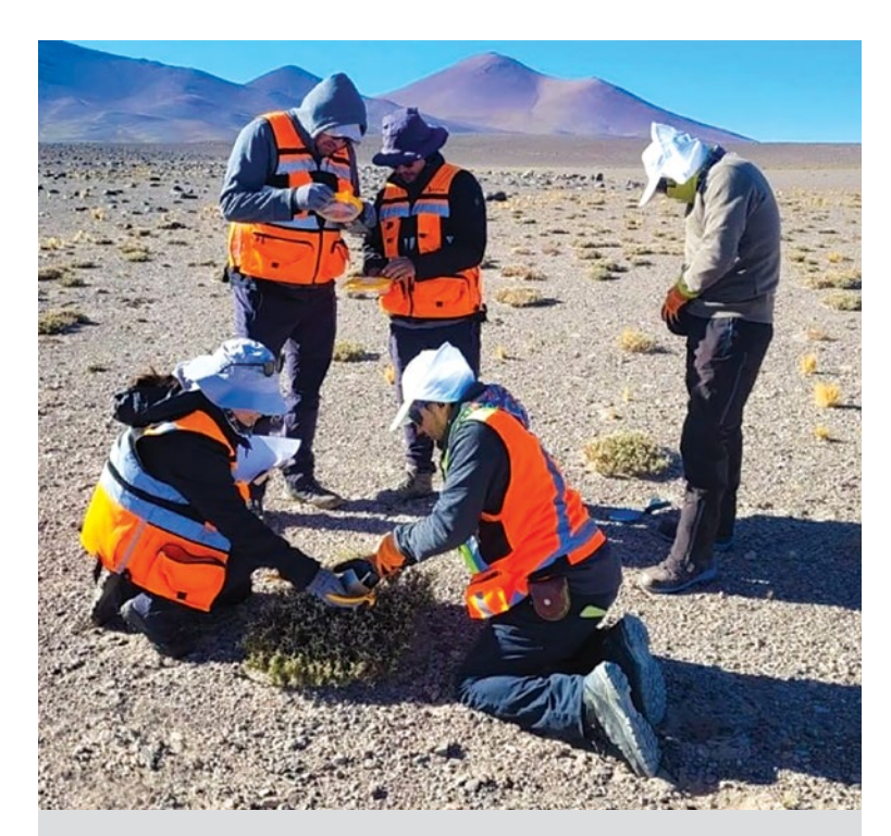
Figure 5: The MSB team, along with local indigenous people, have been collecting seeds for transplantation before construction commences.